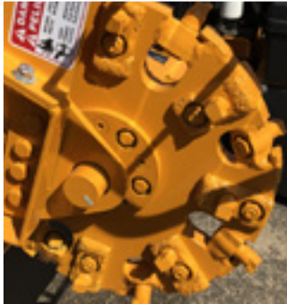
New Revolution Wheel