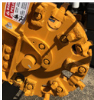
New Revolution Wheel